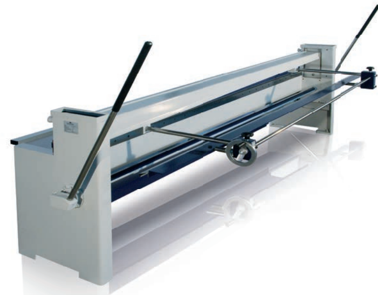
Manual shear HS

The eccentric shear HS will be used for nearly all cutting requirements. Ridge-free, distortion-free and nearly burr-free cuttings are the typical characteristics of this shear.