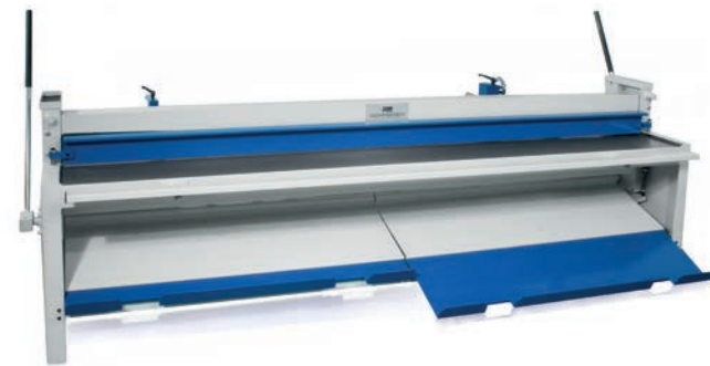
Telescope sheet shute incl. stacking function