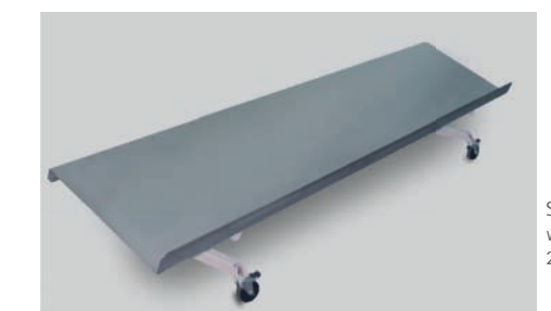
Sheet shute on wheels with 4 steering castors, 2 lockable.

In order to ensure the most efficient operation, you can acquire the manual back gauge which is adjustable from the front and has a digital readout. With this option the operator does not need to walk around the machine as he can easily adjust the gauge directly from the front. Also here, the sheet support in connection with the sheet shute completes the system.