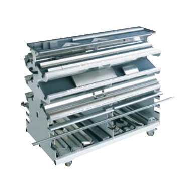
Always tidy: Use our practical tool cart for blades, rails, and segmented tools