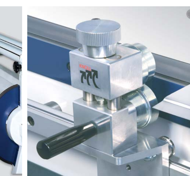
The profiling and flattening wheels are used to give the piece