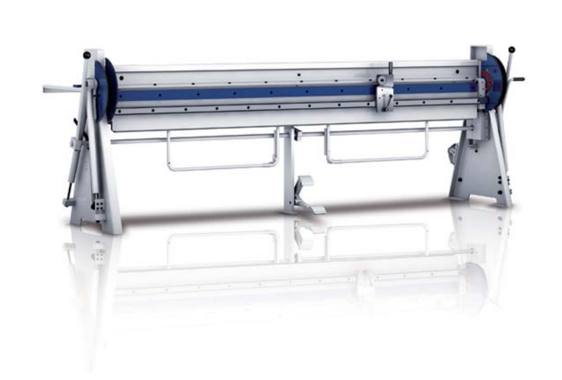
The sheet support table incl. back gauge with its displaceable and removable supporting rails provides for highly variable working options.

The manual folding machine type AK is the classic workshop machine for the daily use in small and mid-sized enterprises - simply indestructible and easy to