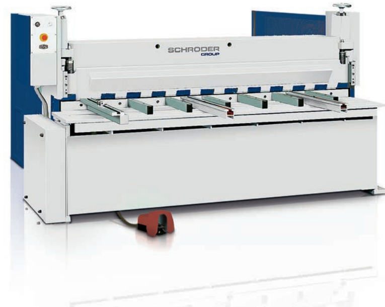
The heavy duty crank guillotine with sturdy permanent accuracy.

The heavy-duty guillotine 527 meets the requirements of the demanding craftsman, but can also cope with the constant load of daily industrial practice.