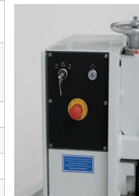
FM 1S software control