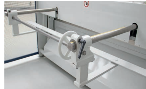
Manual back gauge, adjustment range 10 - 600 mm