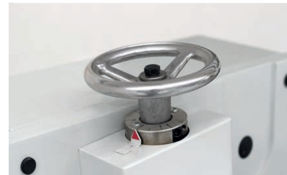
Manual blade gap adjustment