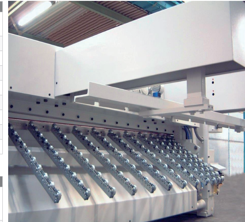
Pneumatically controlled sheet support will ball castors.